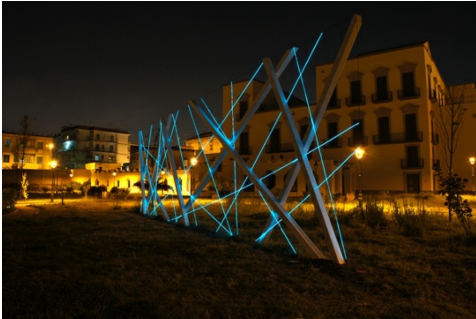
(Frequenza Fondamentale (Fundamental Frequency), 2012, Steel, Electroluminescent cable, Portici – Naples (Italy)

Our idea is to use the data collected by the monitoring network of the Vesuvius Observatory in order to modulate, in real time, the sound scenery (composed by the musician Mario Masullo aka Mass) to be spread all around the park, so that the sound variations one can listen into the park are a direct expression of the volcano activity.