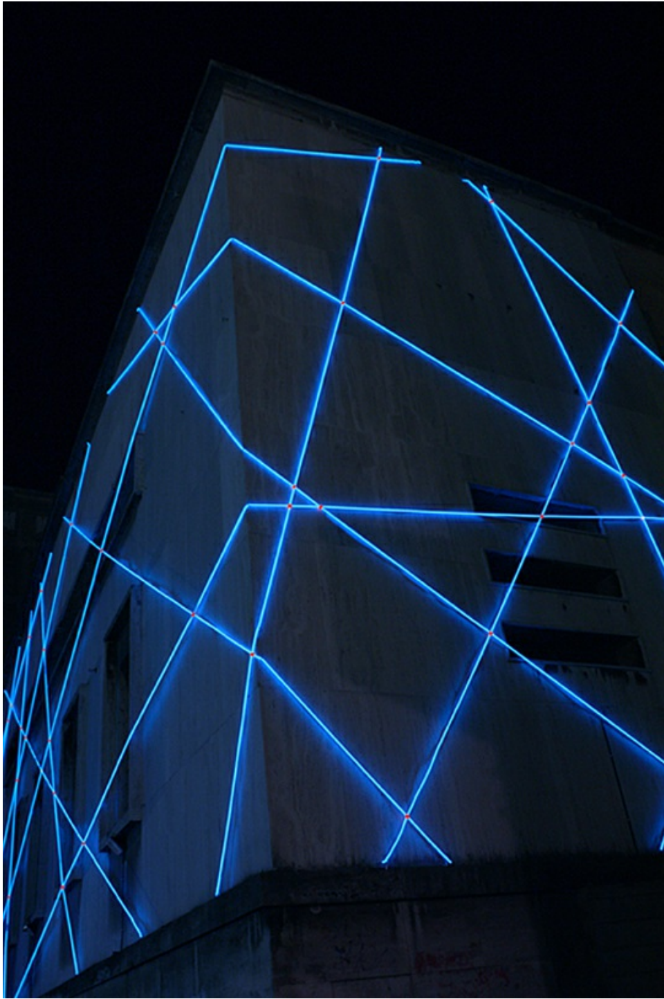
Relational, 2009, Electroluminescent Cable, Potenza (IT)

One detail that we don't often reveal is that the basic structure of these relational artworks links the geographic coordinates of some of our particular travel destinations we reach every year (since 2001) in order to test on ourselves a theory which is based on hypothetic influence of the planets on living beings (Aimed Solar Returns).