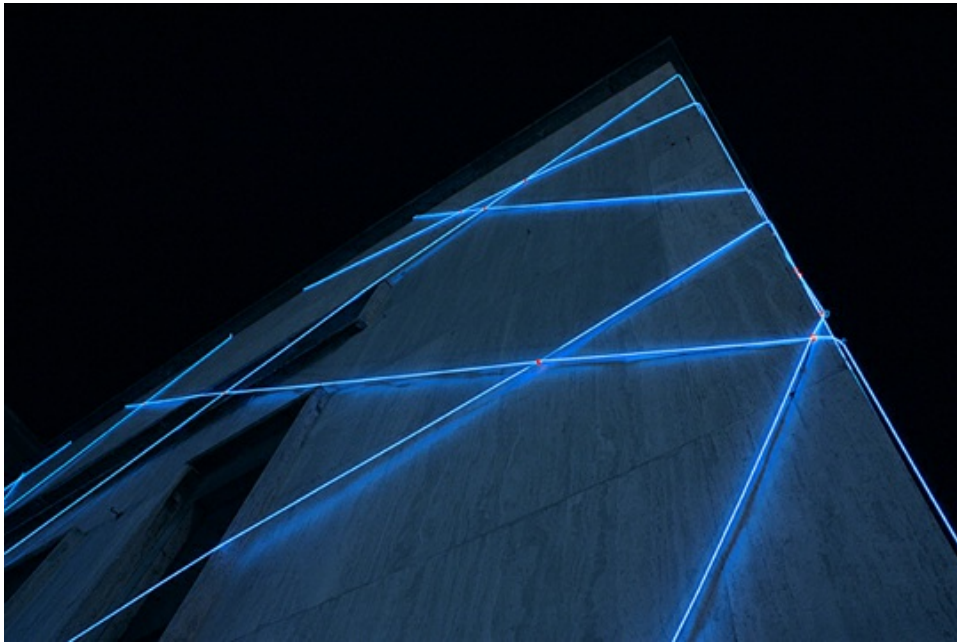
Relational, 2009, Electroluminescent Cable, Potenza (IT)

Over the years we have realized that events and people are closely bound together by infinite invisible ties we try to make visible through our artworks, including a series of monumental light installations made of electroluminescent cables titled 'Relational'.