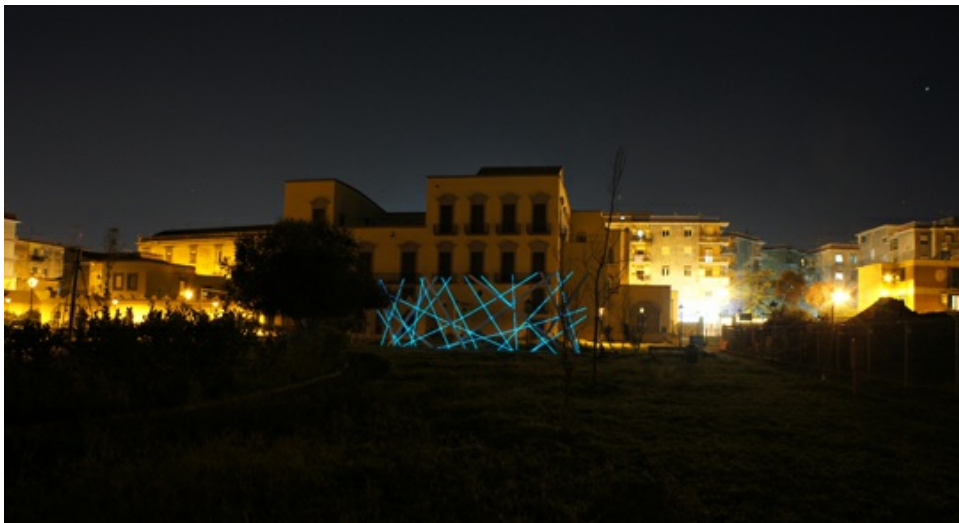
(Frequenza Fondamentale (Fundamental Frequency), 2012, Steel, Electroluminescent cable, Portici – Naples (Italy)

Our idea is to use the data collected by the monitoring network of the Vesuvius Observatory in order to modulate, in real time, the sound scenery (composed by the musician Mario Masullo aka Mass) to be spread all around the park, so that the sound variations one can listen into the park are a direct expression of the volcano activity.