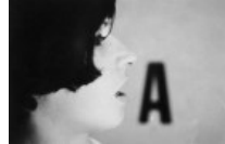
Luca Patella: Animated Projected Environments