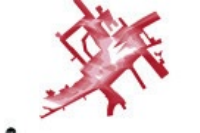
FRAME > Operative Cartographies