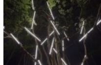
VIDEO POST > Volcano Choir – Byegone